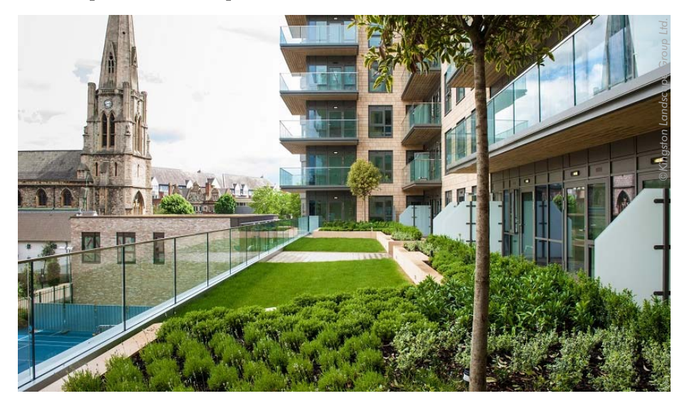
Wonderful view onto the listed Christ the Saviour church from one of the greened roof terraces.