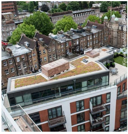
A green roof with sedum matting and aluminium edging was installed on one of the buildings.